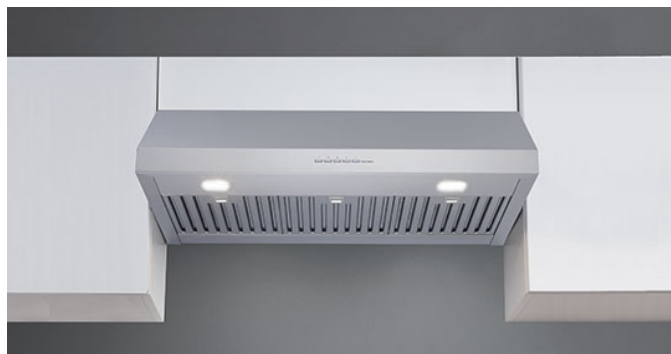
Photograph is for information purposes only May not correspond to the selected version