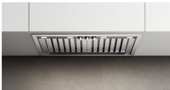
Photograph is for information purposes only May not correspond to the selected version