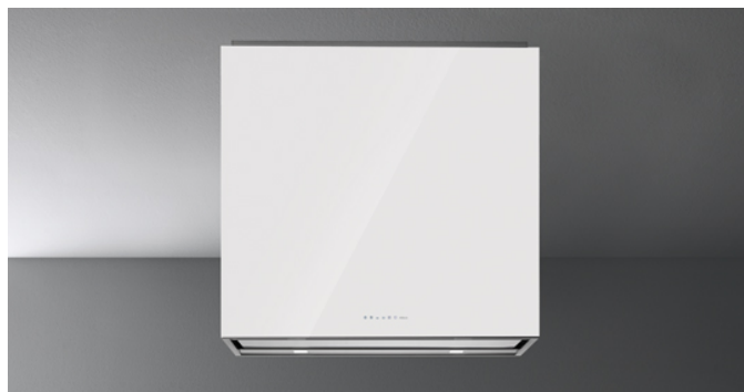
Fotografie cu caracter strict orientativ Aceasta poate sa nu corespunda versiunii selectate