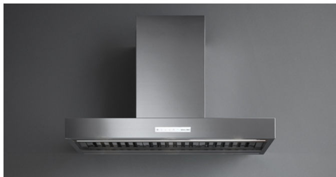
Photograph is for information purposes only May not correspond to the selected version