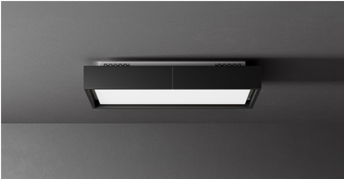
The photograph is purely for information It may not correspond to the selected version.