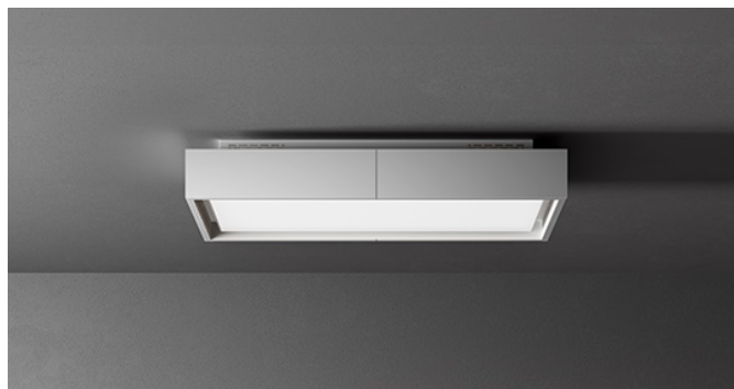
Photograph is for information purposes only It may not correspond to the selected version.