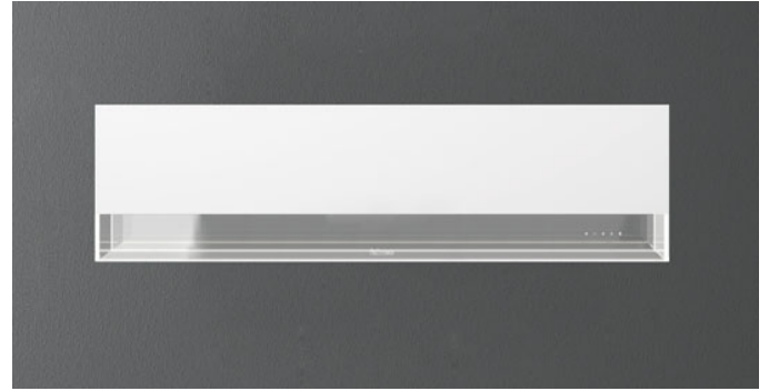
The photograph is purely for information It may not correspond to the selected version.