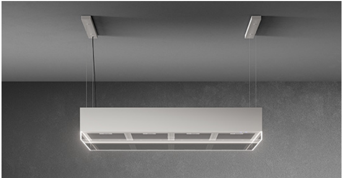
Photograph is for information purposes only It may not correspond to the selected version.