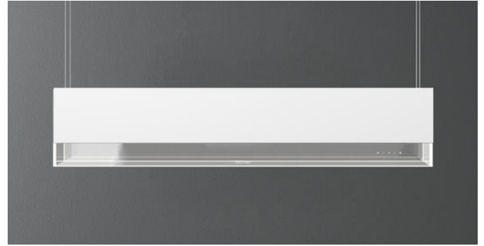
The photograph is purely for information It may not correspond to the selected version.