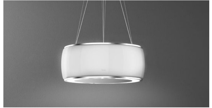
The photograph is purely for information It may not correspond to the selected version.