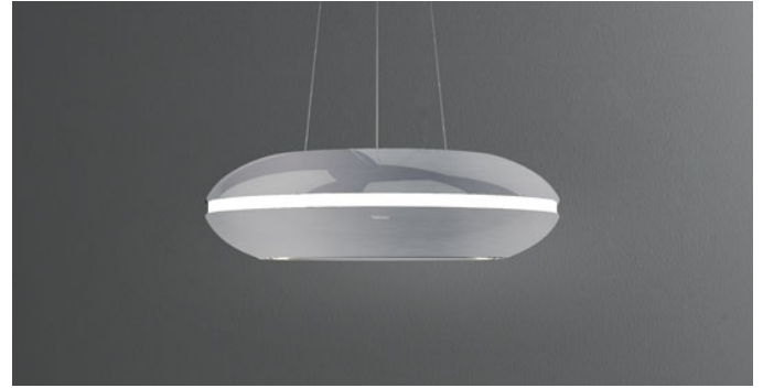
The photograph is purely for information It may not correspond to the selected version.