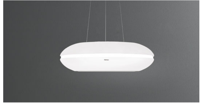
The photograph is purely for information It may not correspond to the selected version.