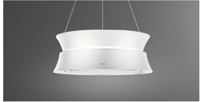
The photograph is purely for information It may not correspond to the selected version.