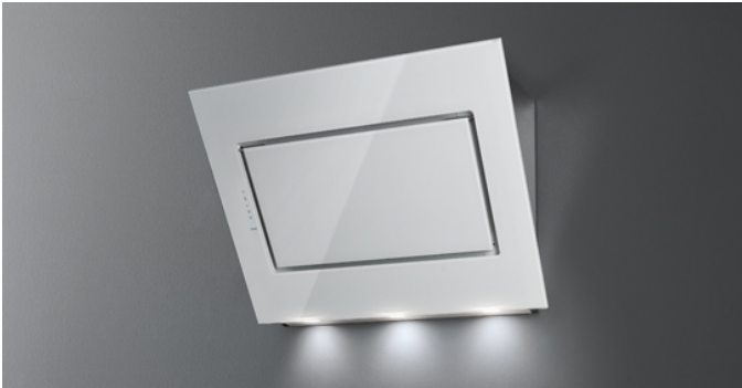
Photograph is for information purposes only May not correspond to the selected version