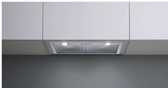
Photograph is for information purposes only May not correspond to the selected version