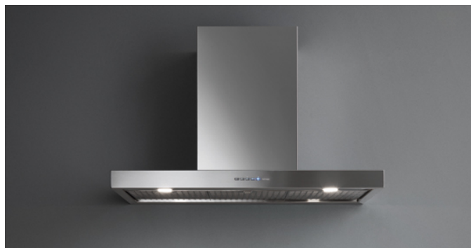
Photograph is for information purposes only May not correspond to the selected version