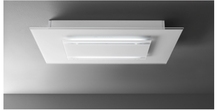
The photograph is purely for information It may not correspond to the selected version.