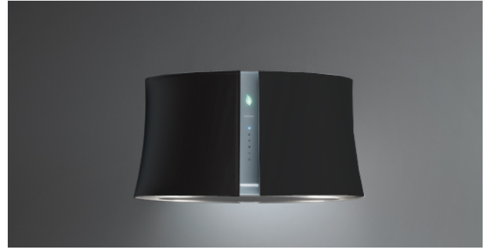
The photograph is purely for information It may not correspond to the selected version.