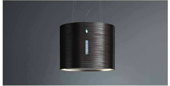
The photograph is purely for information It may not correspond to the selected version.