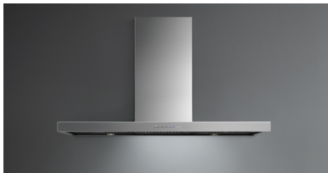
Fotografie cu caracter strict orientativ Aceasta poate sa nu corespunda versiunii selectate