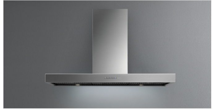
The photograph is purely for information It may not correspond to the selected version.