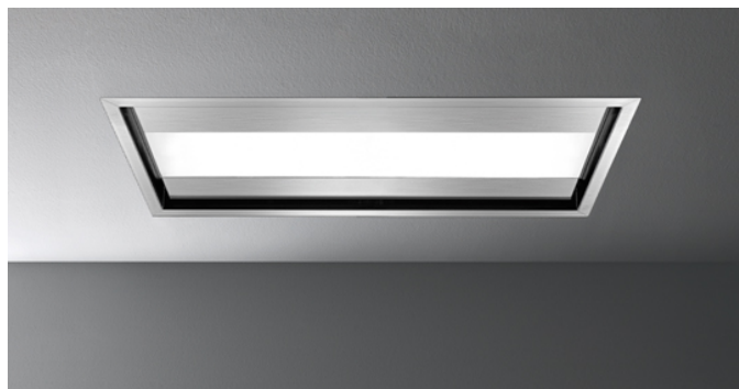
Photograph is for information purposes only May not correspond to the selected version