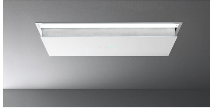
The photograph is purely for information It may not correspond to the selected version.