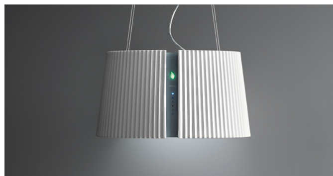
Photograph is for information purposes only It may not correspond to the selected version.