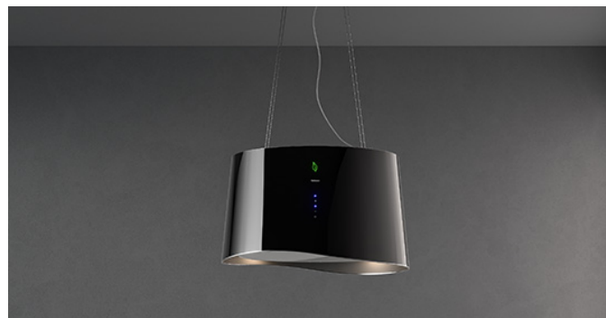
Photograph is for information purposes only It may not correspond to the selected version.