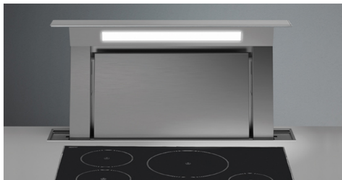
Fotografie cu caracter strict orientativ Aceasta poate sa nu corespunda versiunii selectate