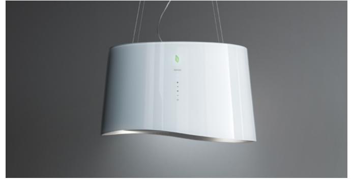
The photograph is purely for information It may not correspond to the selected version.