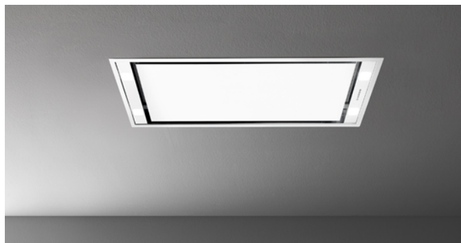
Fotografie cu caracter strict orientativ Aceasta poate sa nu corespunda versiunii selectate