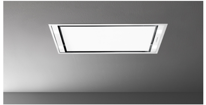
The photograph is purely for information It may not correspond to the selected version.