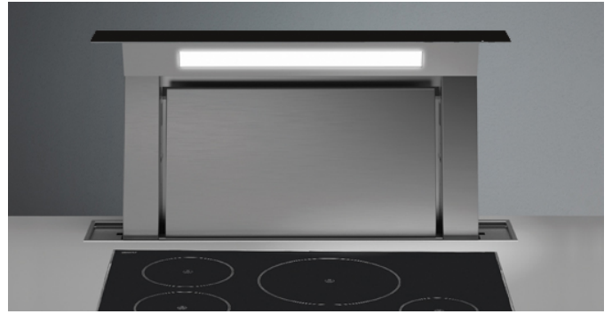
The photograph is purely for information It may not correspond to the selected version.