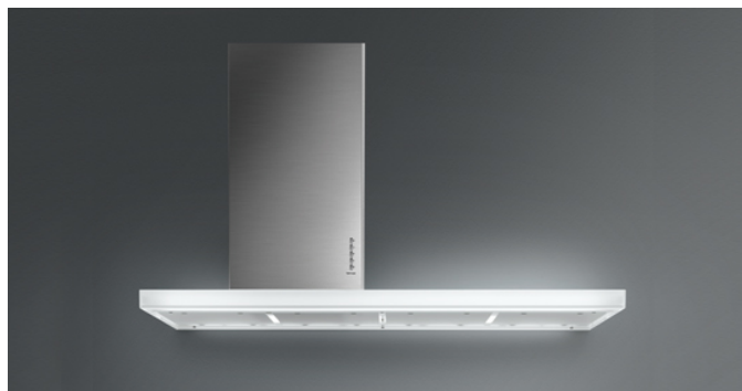
Fotografie cu caracter strict orientativ Aceasta poate sa nu corespunda versiunii selectate