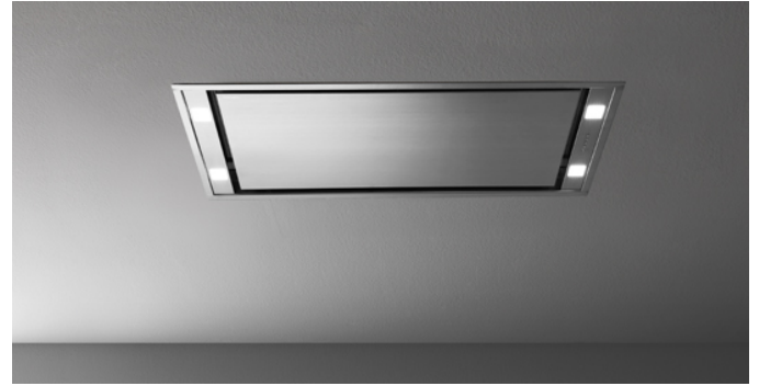
The photograph is purely for information It may not correspond to the selected version.