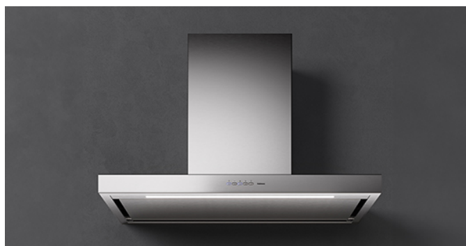
The photograph is purely for information It may not correspond to the selected version.